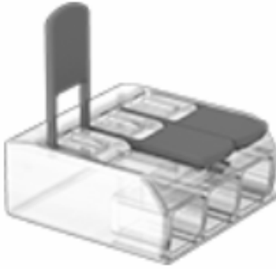
Diagram 3 – Example of Clamp-On Wire Splicing Connectors suitable for both solid and stranded wires.