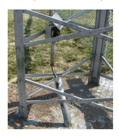
Photo F1 – Deteriorated and incomplete conduit system with exposed conductors