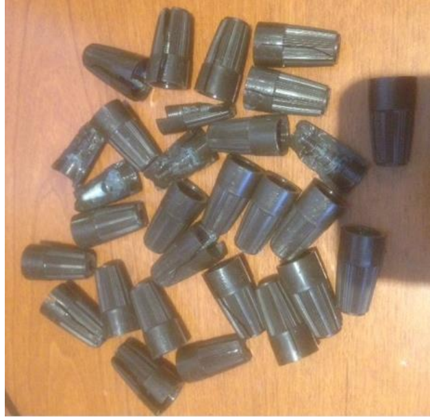
Figure F2 – Non-Petroleum based inhibitor failures