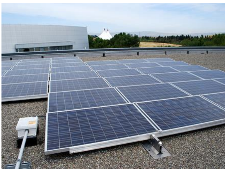
c) Cable support

Cables and conduit shall be kept clear of sharp metal, be properly supported and shall not lie loosely on the roofing material.