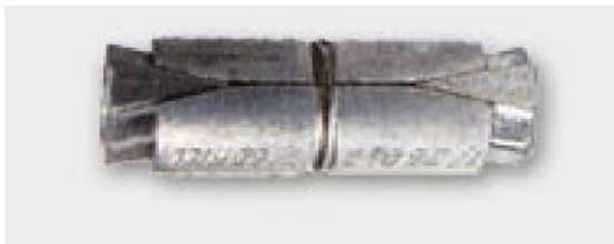
Concrete Double Expansion Anchor