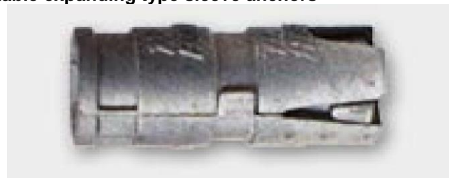
Concrete Single Expansion Anchor